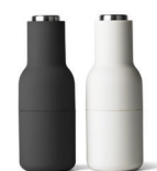
Ash / Carbon 4415599