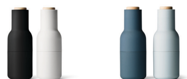
Ash / Carbon 4415399