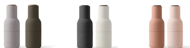
Hunting Green / Beige 4415459