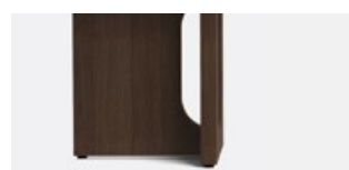
DARK STAINED OAK

Androgyne Dining Table, Rectangular 210 x 100, Natural Oak, by Danielle Siggerud Harbour Dining Chair, Dark Stained Oak / Moss 004, by Norm Architects Stackable Glasses, by Norm Architects Water Bottle, 0,5 L, ClearGlass/Brass, by Norm Architects