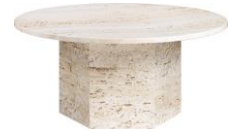
// Neutral White