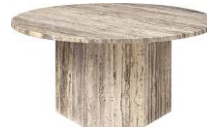
// Vibrant Grey