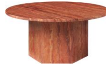
// Burnt Red