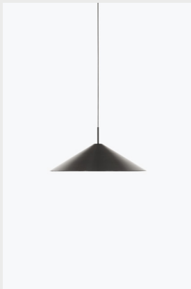
Item No: 21520/21520US Variant: Brolly Pendant Ø70