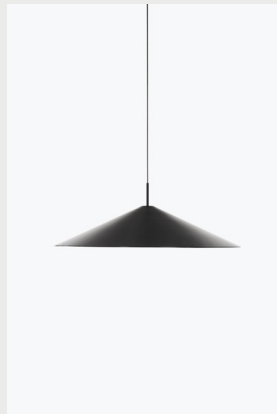
Item No: 21530/21530US Variant: Brolly Pendant Ø90