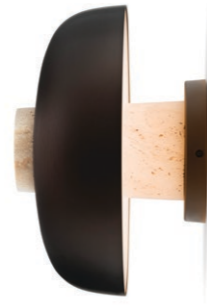
BRONZED BRASS 71230-007327