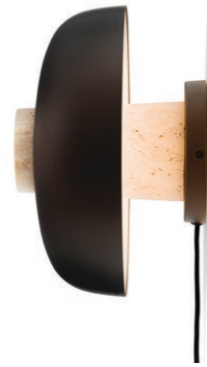
BRONZED BRASS 71230-007328