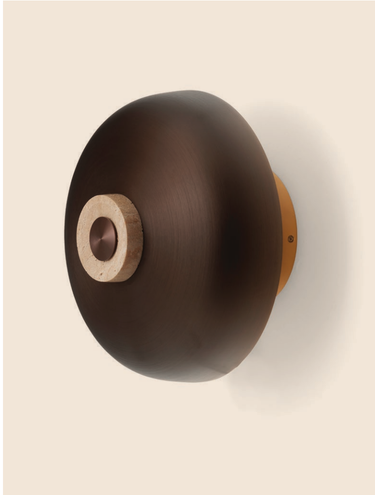
REVERSE WALL LAMP Designed by Aleksandar Lazic