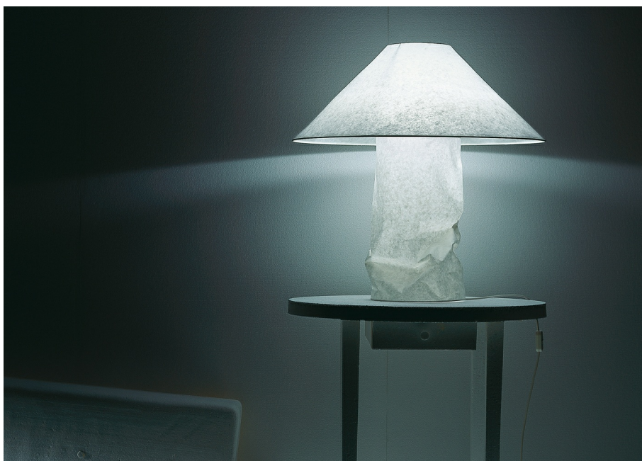
Lampampe INGO MAURER 1980

Japanese paper, metal. Lampampe is part of a series of simple lamps made of Japanese paper that Ingo Maurer developed in the late 1970s / early 1980s. In this design, he takes up the shape of traditional lampshades and yet formulates a new aesthetic. The shades are handmade in our production facility in Munich. The paper creates a soft, completely glare-free light. The paper is slightly creased as a deliberate design element.