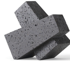
Black / Grey 4210149