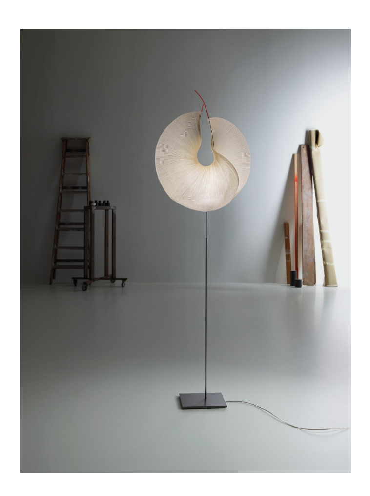
Yoruba Rose Floor INGO MAURER TEAM 2020

Paper, metal, stainless steel, silicone. Yoruba Rose Floor is a new version of the floor lamp Yoruba Rose. Just as in all other MaMo Nouchies, the lampshade consists of Japanese paper, which has to undergo a special manufacturing process in Dagmar Mombach's studio, until the desired shape is achieved. The light source is an LED module, provided with a cooling element, developed by Ingo Maurer especially for the MaMa Nouchies. Its light is so warm and soft, that any difference can hardly be noticed when compared to conventional halogen light sources.