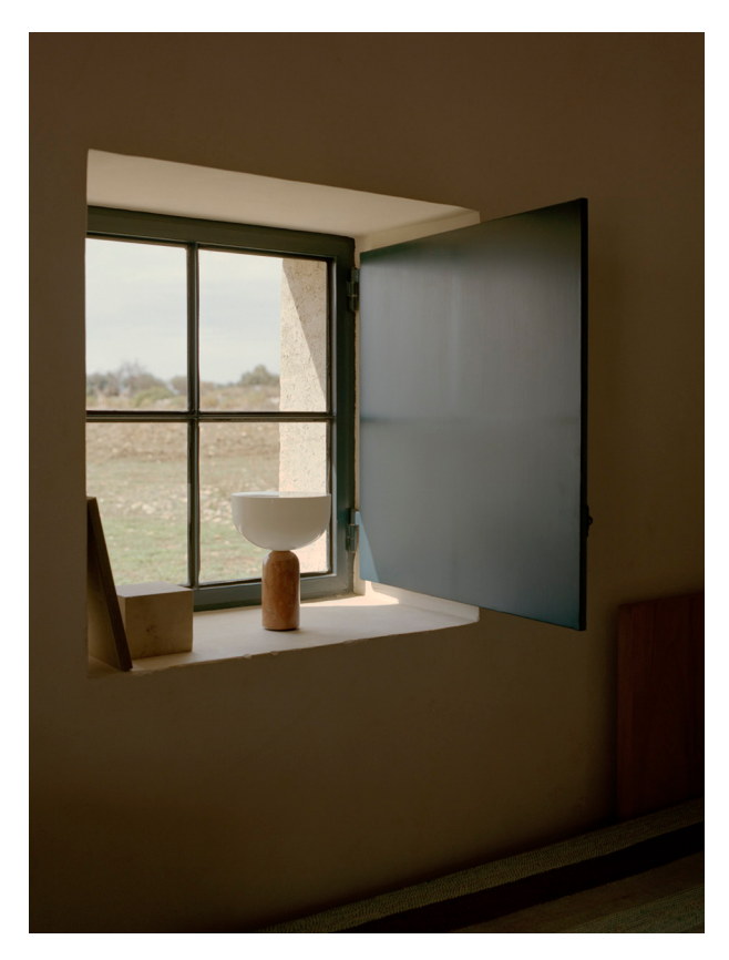
Materials Marble, Acrylic